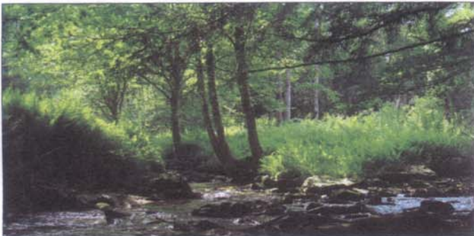
Minister Creek runs close to, and parallel with the trail here.