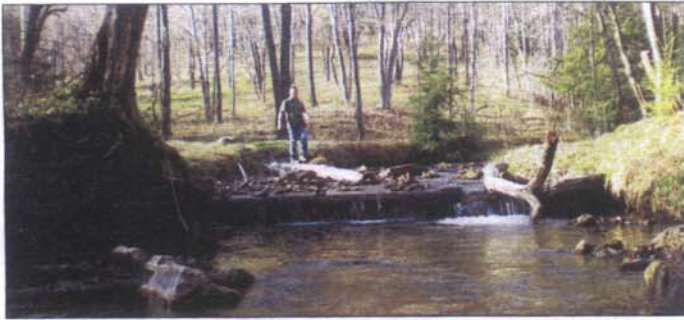
Kirk crossing the creek at the triple forks area, picture taken with a timer. The hill in the background rises up to form the ridge between the two main forks of Minister Creek.