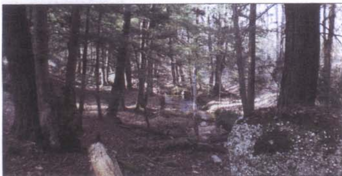
The rock in the right foreground is an example of the conglomerate/sandstone sedimentary rock that is so common in the Allegheny National Forest. Also present in the frame are a number of Pennsylvania's state tree, the hemlock.