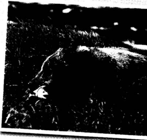
We are teaming up with varied partners to protect the spectacular Tongass National Forest.

of more wilderness in the Allegheny. We have been working with Friends of Allegheny Wilderness to build a citizen effort to create eight wilderness areas, protecting 54,460 acres. These forest lands are popular with campers, hunters, anglers, birders, and boaters, and the areas' watersheds provide clean water to downstream communities. But we are