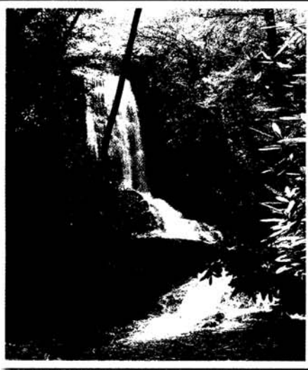
We are part of an effort to improve public access to North Carolina's popular Catawba Falls and other natural areas in the state.