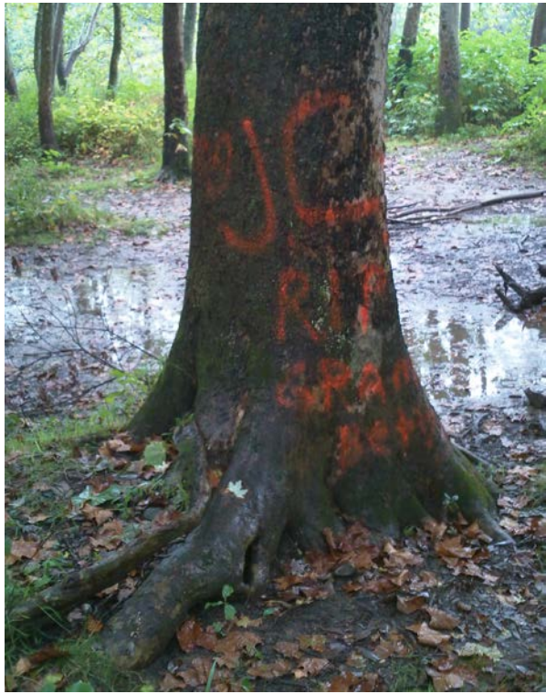
A new coat of graffiti cloaks an ancient sycamore tree on Crulls Island in the Allegheny Island Wilderness, an eyesore that significantly detracts from the wilderness experience. Please help spread the word about not vandalizing our wilderness.

has been occurring for a number of years. Even as you get out further into the wilderness, there have been occurrences. The most pronounced and egregious incident is the most recent one in the Hickory Creek Wilderness area."