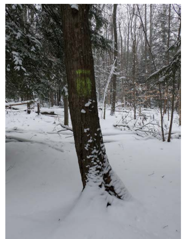
More than 100 'trail blazes' were recently painted on trees along the Hickory Creek Wilderness trail, in the pictured example using day-glo green paint. Visitors should not take it upon themselves to paint blazes along the Hickory Creek Wilderness trail. This significantly detracts from the wilderness experience and is against the law.

Forest Service, offenses associated with damaging any natural resource or property of the federal government, including timber. Title 18 of the United States Code, Section 1361, is the most common statute used to prosecute violators. The penalties for violations of this Section are tied to the extent of the property damage. If the damage exceeds $100, the defendant is subject to a fine of up to $250,000, ten years imprisonment, or both. When property damage does not exceed $100, the offense is a misdemeanor punishable by a fine of up to $100,000, one year imprisonment, or both.