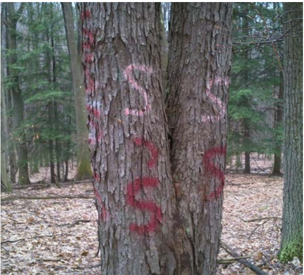
Spray paint graffiti in an off-trail area of the Hickory Creek Wilderness east of Coon Run. Multiple trees at this location were vandalized.

According to Johnson, separate incidents at Crulls Island in the Allegheny Islands Wilderness were just as severe. "This is a federally designated wilderness," he said, "a sacred nature reserve is where the preservation of wilderness values is paramount over all other conceivable concerns for all time to come."