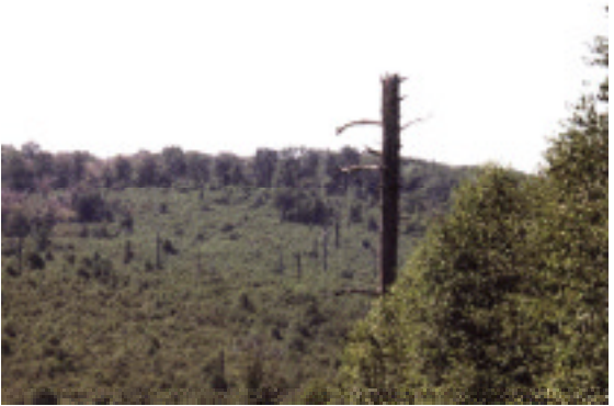
1985 tornado swath through the Cherry Run drainage in the Tionesta Scenic Area.

The Tionesta Scenic Area is a 2,018-acre old growth hemlock- beech forest. In recent years two major disturbances have occurred to this landscape. In 1985 a tornado leveled 800 acres of the forest and within the past few years beech bark disease (beech scale and Nectria fungi complex) has killed or severely weakened most of the mature beech trees. The understory consists mostly of beech coppice which has sprouted from the living roots of the mature beech trees that succumbed to the tornado or to beech bark disease.