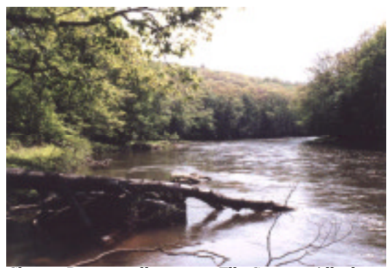
Clarion River roadless area, Elk County, Allegheny National Forest.

(PNDI) program. Aerial photographs and over flights assist in choosing sites to visit on the ground. In fact, a large part of these studies involves site visits to catalogue species, assess quality, and determine the viability of the species and communities that exist in any particular area. Scientists working on the study contact public and private landowners to receive permission to visit and to collect additional site information. Although the methodology of the inventories is the same, the size and remoteness of many of areas in northern Pennsylvania provides some real challenges.