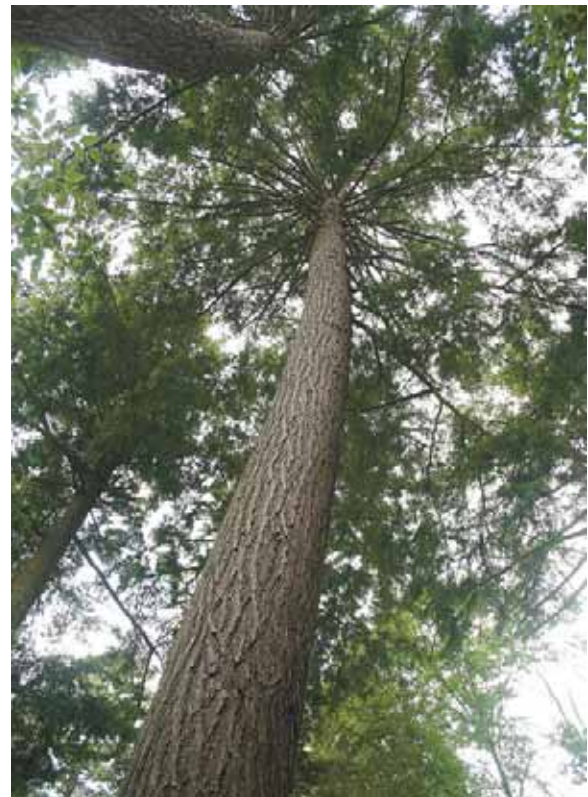
Ancient eastern hemlock tree ( Tsuga canadensis ), Allegheny National Forest.

Decomposing nurse logs transform into a moist, elevated pile of fertilizer, which makes an ideal environment for seeds and sprouts to grow. On top of these huge logs, tiny seeds do not have to compete with faster-growing seedlings on the forest floor, are not smothered by leaf litter, and are safe from fungus pathogens to which they are susceptible. The nurse log also provides greater warmth and longer snow-free periods.