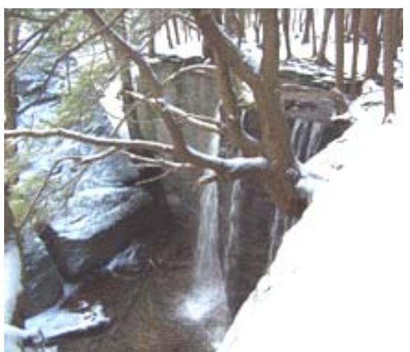
Hector's Falls, in the northern end of the proposed Tionesta Wilderness Area. Unfortunately, this area was not recommended for wilderness designation in the final ANF Forest Plan.

totaling 54,460 acres as prospective additions to America's National Wilderness Preservation System (NWPS). Several of these tracts, such as the proposed Tracy Ridge Wilderness Area, are formally recognized Roadless Areas and areas that members of Pennsylvania's Congressional delegation advocated to protect as wilderness in the past. Other Roadless Areas neglected by the plan include Allegheny Front, Clarion River, and Cornplanter.