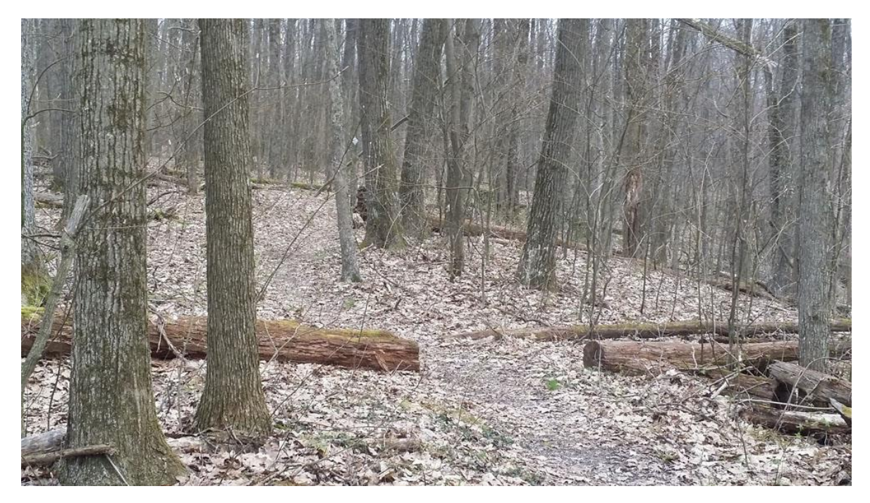
Photo 1. Section of trail between markers 1 and 2.^{10} Trail tread is quite wide and well-established.

Currently, the system has a backlog of maintenance needs, including the log out of downed trees, maintenance of drainage structures, brushing and trail tread work.<sup>9</sup> Some sections of the trail would also benefit from short re-routes that would reduce the grade and eliminate unsustainable "fall-line" trail construction. Given higher-use trails and higher priorities, the Forest Service does not have the resources to properly maintain this 34-mile single use trail system. This situation is not likely to change in the foreseeable future.