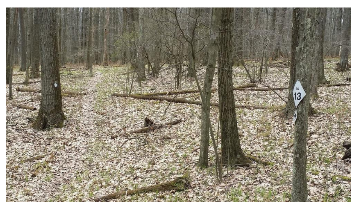
Photo 3. Section of trail between markers 16 and 13. This section of trail was built in the 1990s and shows minimal use.

Photo 2. Section of trail between markers 2 and 15.