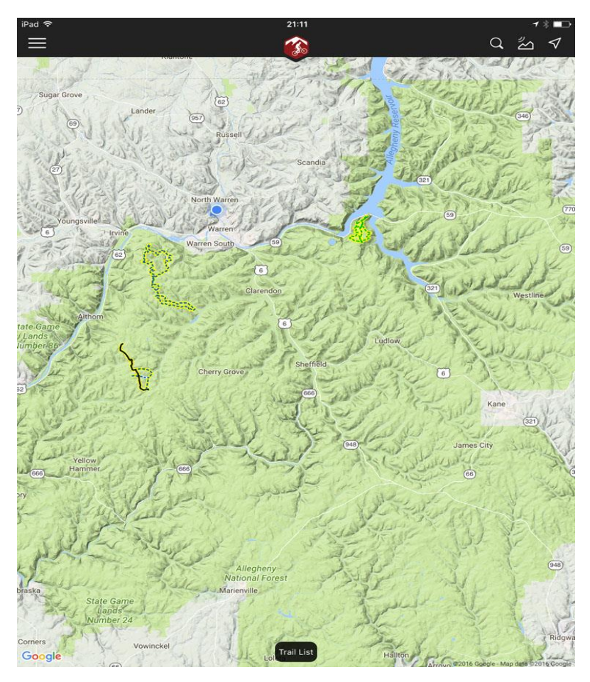
Figure 2. Mountain bike opportunities on the Allegheny National Forest (MTB Project)

MTB Project is an online resource for mountain bike trails. The website/app is designed by Adventure Project, in partnership with REI and the International Mountain Bicycling Association. For the Allegheny National Forest, three trail opportunities are listed: Jakes Rocks, Tanbark/Hearts Content and the Rocky Gap ATV trail. See Figure 2 for a screenshot of the trails listed for the ANF.